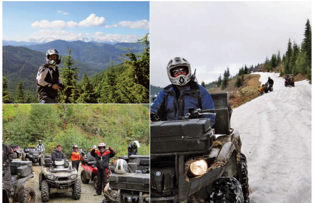
S.W.A.T.T. is working hard to improve riding areas in B.C. - support their cause this July.