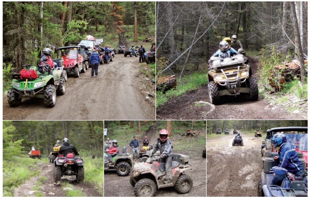
HAVE QUAD, WILL TRAVEL: The Greater Kamloops ATV Association is holding a fundraising ride on May 15th. Proceeds will be shared by the food bank and Barnhartvale Community Hall.