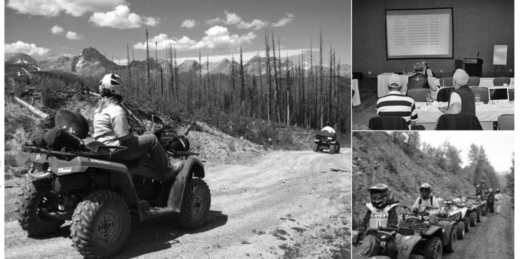
INSIDE AND OUT: Spring Fling, an annual event organized by ATV/BC, includes both indoor and outdoor events, such as informative workshops, family-oriented rides and a trade show.